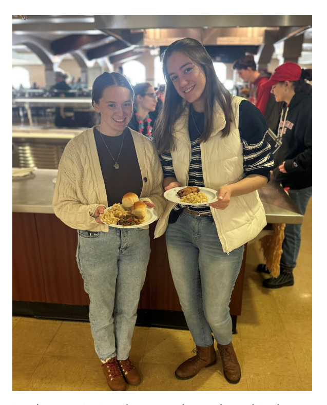
Students enjoying the Luau Themed meal in the Dining Hall!