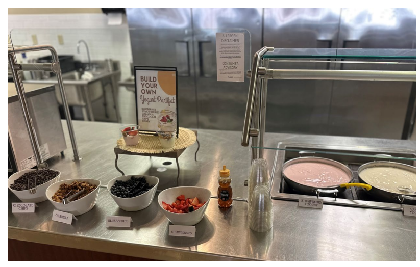
Build your own yogurt parfait was featured at our specialty station in the Dining Hall on January 19th. Strawberry and vanilla yogurt was served with the topping options of fresh blueberries, fresh strawberries, chocolate chips, granola, and honey!