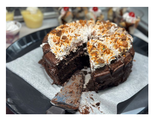
The chocolate peanut buttercup cake! Grab it while you can, this cake goes fast as it is one of the students' favorite options!