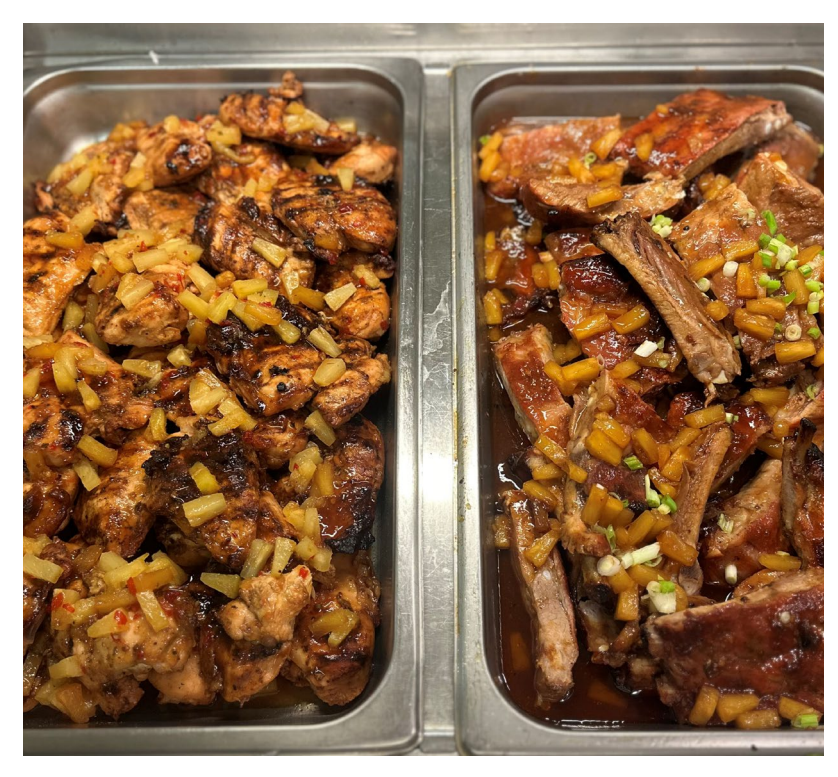
BBQ Pork Ribs and Hawaiian Glazed Chicken for our Luau Themed Meal.