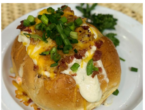
On January 24th, Chef made bread bowls with the option of baked potato or broccoli cheddar soup. There was a toppings bar that gave students the option to customize their bowl!