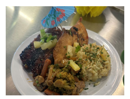
A plate from our Luau Themed Meal.

January 10<sup>th</sup>, 2024 For our themed meal this month, we had a Luau! The menu included: BBQ Pork Ribs, Hawaiian Glazed Chicken, Coconut Rice, Hawaiian Roasted Vegetables, and Hawaiian Rolls.