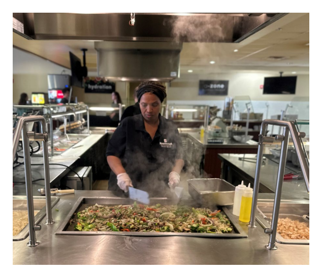
Fresh cut vegetables on the flat top for Stir Fry Day!